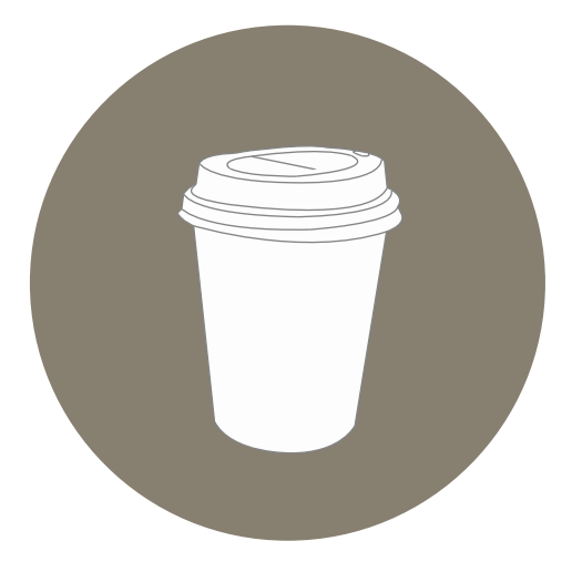
Paper Coffee Cup