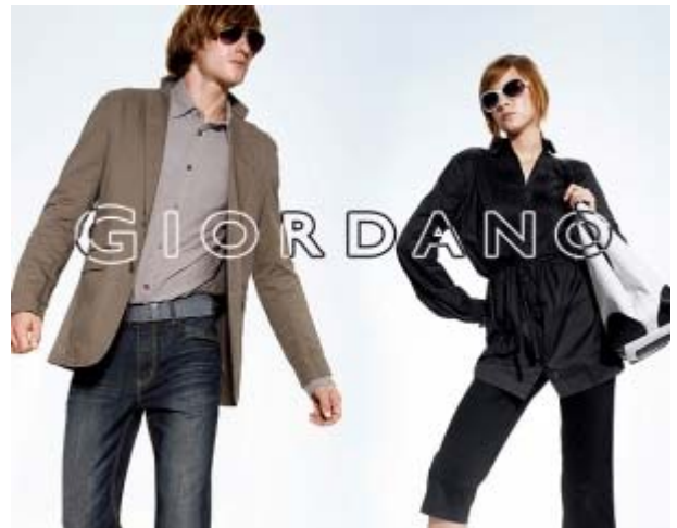
Figure 2 Giordano, 2008

fashionable and more expensive ‘Concepts’ line to the more basic and casual Giordano and Junior labels, which have been compared to The Gap. (Figure 2) In common with The Gap, Giordano is a major client of the Esquel Group, the Hong Kong-based cotton manufacturers, mentioned above, and also of the Hong Kong TAL Group, which promotes its cutting edge manufacturing technologies; both of which are produced on the mainland. xv