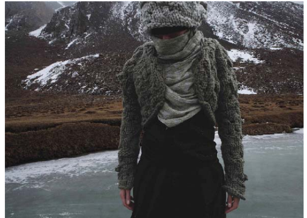
Figure 4 Exception de Mixmind, 2009

sustainability, and the preservation of traditional materials and ways of manufacturing. (Figure 4)