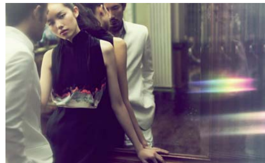
Figure 3 Shanghai Tang, Spring/Summer 2010

Kong in 1994 by local entrepreneur David Tang, Wing-Cheung, attempted to establish a “unique” design strategy, based on the representation and mythologizing of “Chineseness,” to appeal to a global market, including China. From the outset the company aimed at becoming “the first global luxury Chinese brand” through a design strategy that reinterpreted the Orientalist styles associated with Shanghai in the 1930s. (Figure 3) The flagship store opened in central Hong Kong, followed by a shop in New York, and then in other major world cities. xviii The design strategy was based on retro and nostalgia, and was popular with expatriates and foreign visitors to Hong Kong. But some local Hong Kong Chinese found it so unacceptable as to be offensive. Nonetheless, the intention was always to take the brand into the mainland.(Clark 2009) In the early years this ambition was more difficult due to a limited customer base; but even today when the company has several stores in Shanghai and Beijing, in Hangzhou and Guangzhou, many are located in international hotels or in airports.