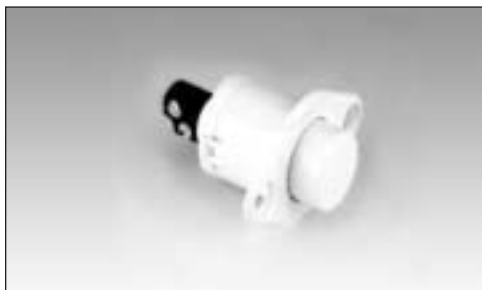
955PST with unique broad face actuator, distributes impact more evenly