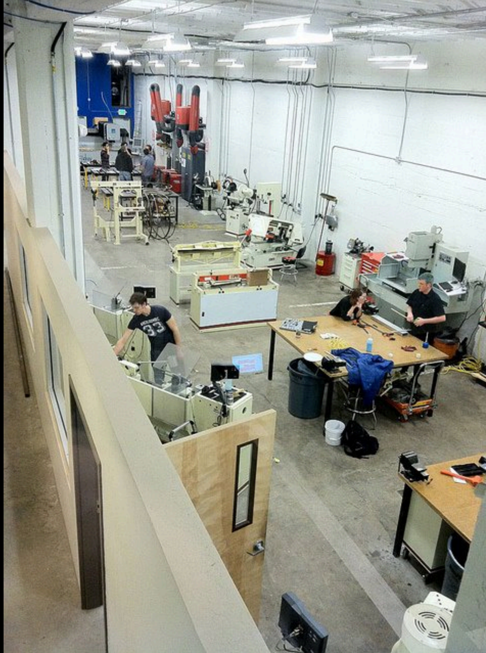
TechShop, San Francisco, 2011