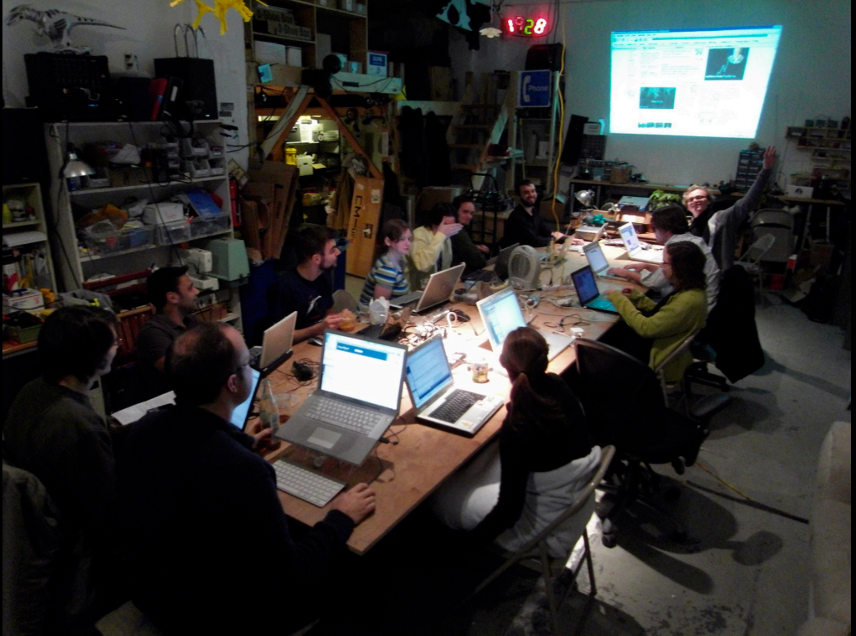
NYC Resistor, 2011