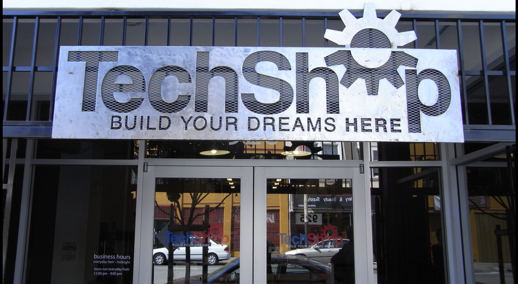
TechShop, San Francisco